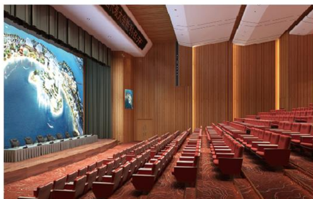
阶梯会议室 / Lecture Conference Room

可容纳近500人 Accommodating nearly 500 guests