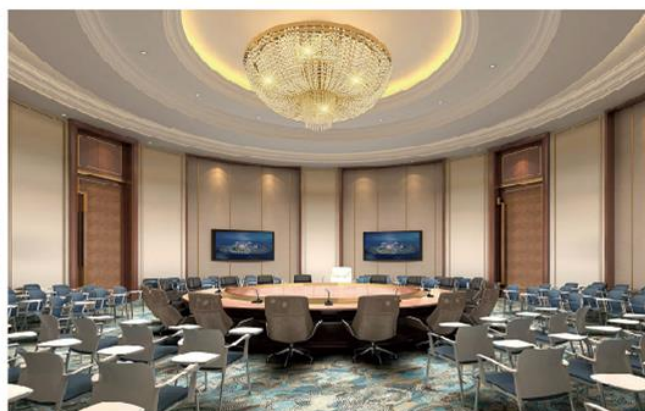
中小型会议厅 / Medium & Small-Sized Meeting Room

可容纳近500人 Accommodating nearly 500 guests