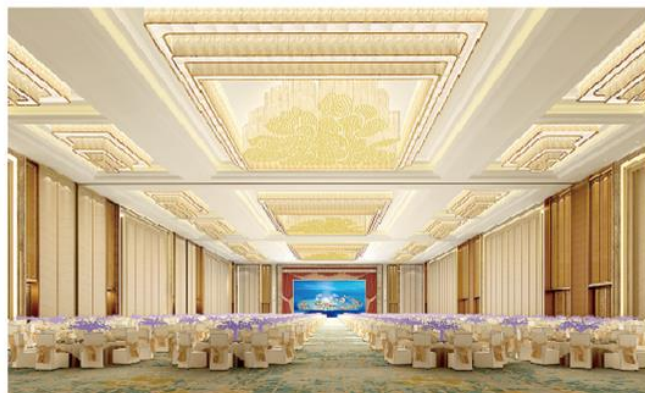
国际宴会厅 / International Ballroom

The International Convention Center has taken root in the core area of Ocean Flower Island, where there are twelve "peonies" in full bloom. Its total construction area is 100000m 2 , and it has 108 conference halls of different specifications, which are built to international summit-level standards. The conference halls support international and domestic brand meetings at different scales, banquet celebrations, performances, new product launches, MICE tourism, high-end customized activities and other needs.